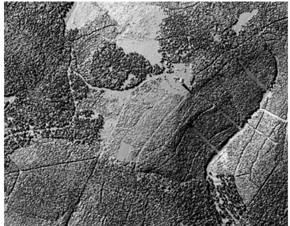
Germany, Harz Forest: shaded relief of non-ground elevation data with vegetation

As well as being used for detailed forest inventories, laser scanning is a valuable scientific tool for the estimation of the biomass of extended forest areas, which can provide a quantitative base for the discussions concerning CO 2 policies.